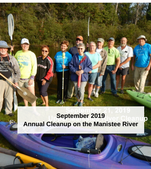
September 21, 2019 Up Annual Cleanup on the Manistee River