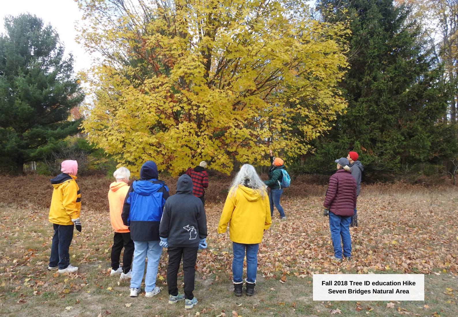
Fall 2018 Tree ID education Hike Seven Bridges Natural Area