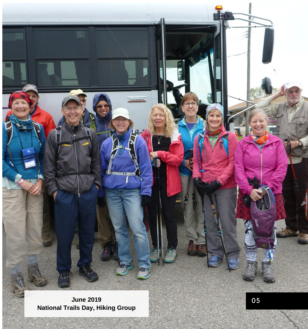
June 2019 National Trails Day, Hiking Group