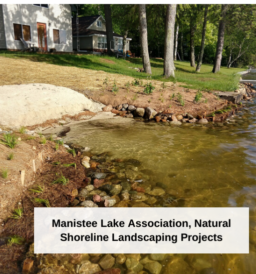
Manistee Lake Association, Natural Shoreline Landscaping Projects